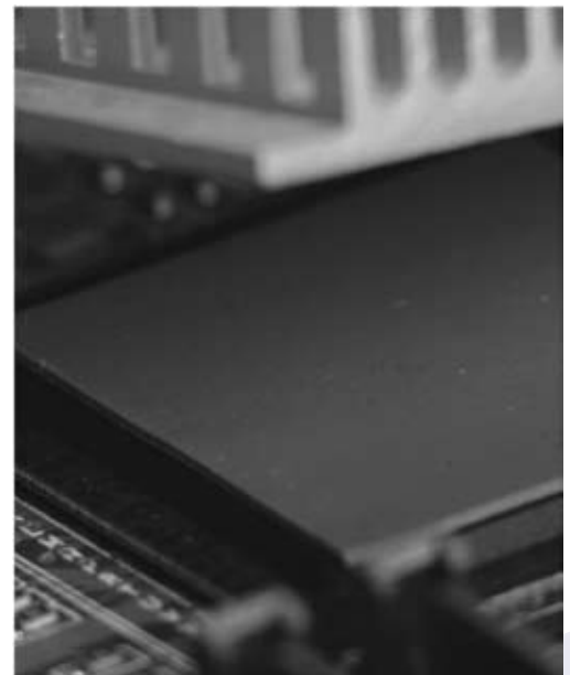
Sample of the 6004 material

The 6004 material, exhibits high deflection (softness); as pressure increases the deflection percentage increases. This material provides good compliance to mating surfaces.