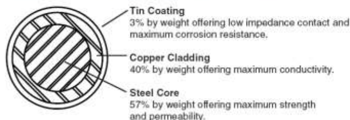
Cross Section of Sn/Cu/Fe Wire — Figure 1