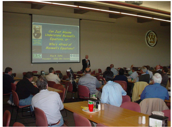
Pittsburgh IEEE EMCS Chapter Technical Meeting on May 18, 2009