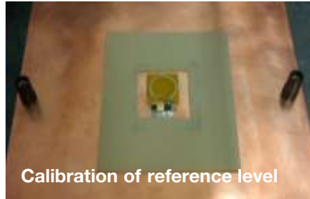
Calibration of reference level

Calibration was performed with a loop antenna without a shield to establish a baseline frequency response. A solid shield was placed over the loop antenna to establish the dynamic range for each frequency (1-10 GHz).