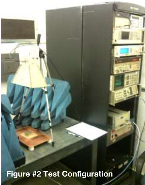
Figure #2 Test Configuration

Radiated testing - Testing was conducted in a shielded enclosure to control spurious emissions. A transmit loop antenna within the various MAJR Shield configurations was used for the test. A dual ridge horn antenna was used as the receive antenna in a far field condition; figure #2 and figure #3.