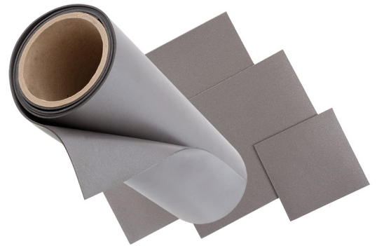
Figure #1 MAJRabsorber configurations